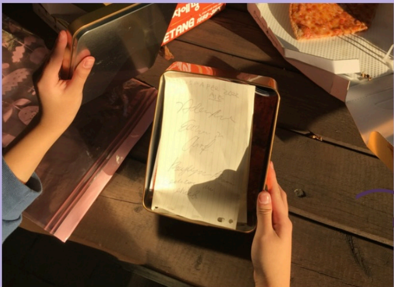
Our Time Capsule!